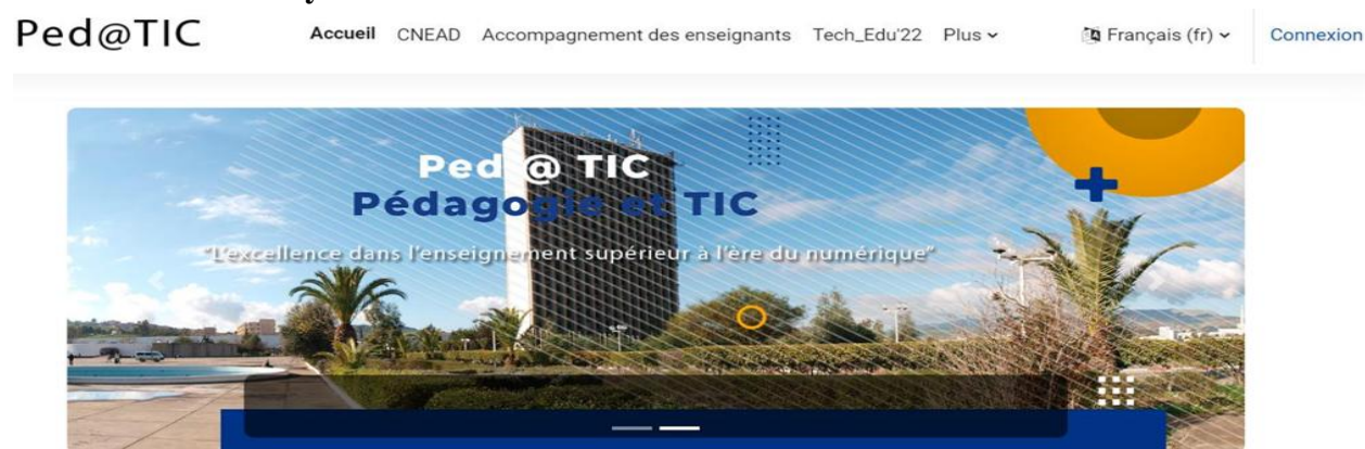
Figure No. 02: Image Illustrating the Interface of the Distance Learning Platform for Newly Recruited University Teachers