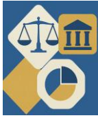
Figure No. 03: Illustrates the Workshops and Activities of the Distance Learning Platform