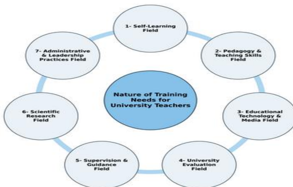
Figure No. 04: Illustrates the Nature of the Training Needs of University Teachers